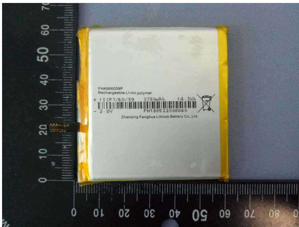
Figure 1 Overall view I of battery